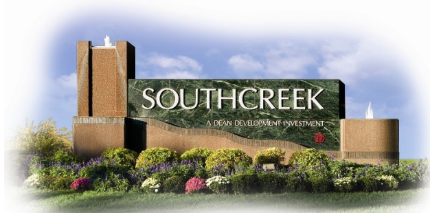
Building I, 12900 Metcalf

Window Office 1st Floor Suite On-Site Management Great Small Suite