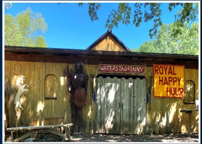
White Stag/ Corp. Event Tent seats 100+