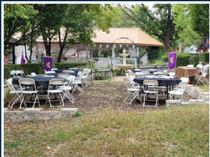
Royal Garden seats up to 80

Contact the Special Events Coordinator at specialevents@kcrenfest.com with questions and to reserve your Corporate event.