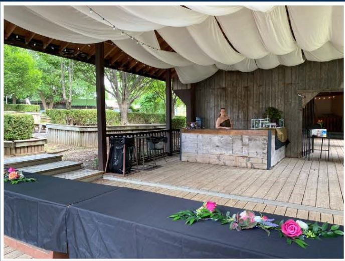
Chapel Deck seats up to 60