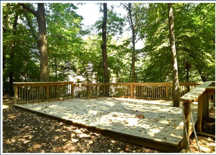
Duxbury seats up to 40 (off season only)